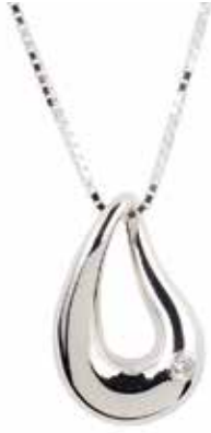
Open Teardrop w/ Clear CZ Stone Price: $180