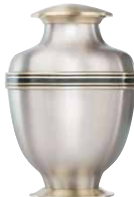
Venice - 3TB100

Brass urn with pewter finish in classic design