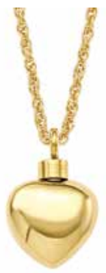
Small Heart IP Plated Price: $155