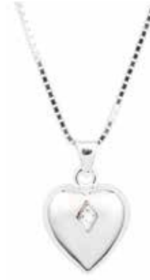
Heart w/ Clear CZ Stone Price: $180