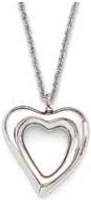
Open Heart Price: $130