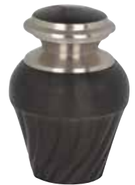
Tuscany Slate Keepsake 3TB851K Price: $95