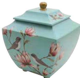
Magnolia Songbirds - 71210447

Hand-painted composite urn with songbird scene