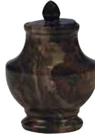
Mallorca Keepsake 3TB400K Price: $125