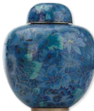
Blue Sapphire - 3CL826

Cloisonné floral design in multiple shades of blue