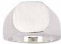
Signet Ring Price: $225