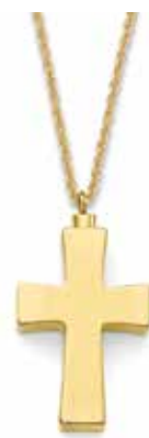
Small Cross IP Plated Price: $145