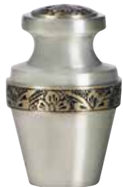
Milano Floral Keepsake 3TB600KS Price: $95