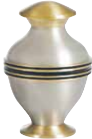
Venice Keepsake 3TB100K Price: $95