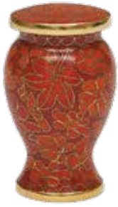
Autumn Leaves Keepsake 71065485 Price: $150