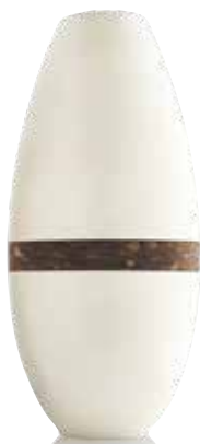
BioTree White - 71209953