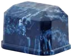
Navy Blue Marble Keepsake 3WM460KS Price: $125