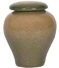
Willow Keepsake 3TB595K Price: $95