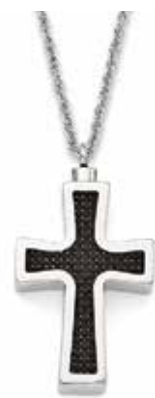
Carbon Fiber Cross Price: $175