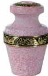
Pink Milano Keepsake 3TB700KS Price: $95