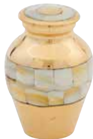
Mother of Pearl Keepsake 71009860 Price: $85