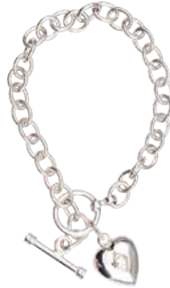
Toggle Closure Charm Bracelet with Heart w/ Clear CZ Stone Price: $260