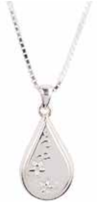
Etched Teardrop Price: $180