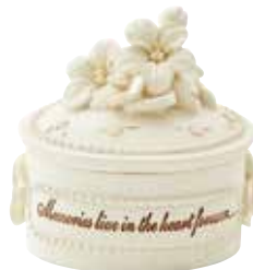
Blossoms Keepsake 71085978 Price: $95