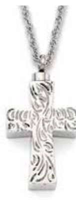
Etched Cross Price: $145