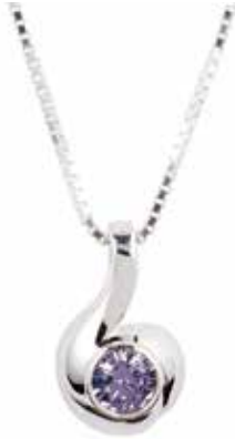
Swirl w/ Birthstone Shown w/ February Price: $180