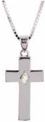
Cross w/ Clear CZ Stone Price: $180