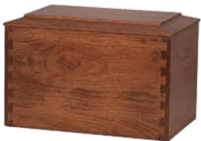
Revel - 71214603

Cherry hardwood urn in a simple design. Engraving options available.