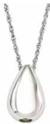
Large Teardrop Price: $145